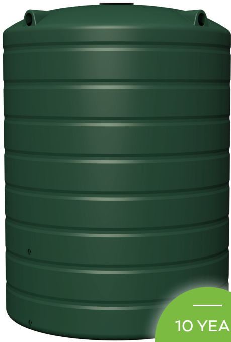
Shown in Dark Green