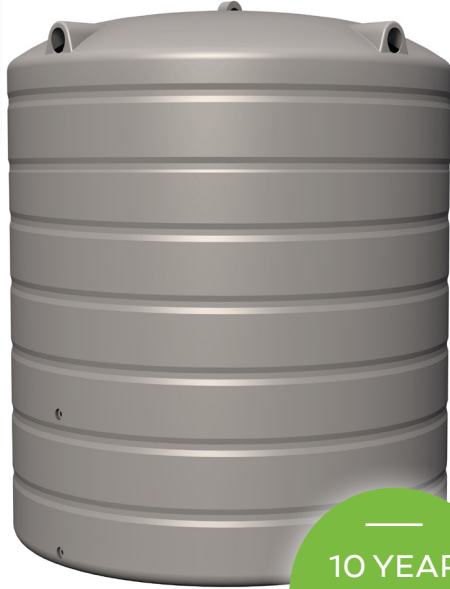
Shown in Birch Grey